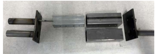
Slider with flat plates