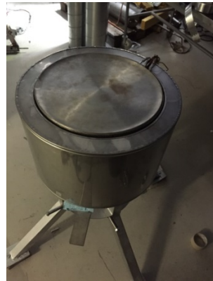
40 cm frying pan