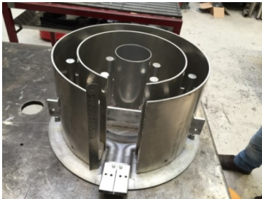
Heating elements and conducting fins